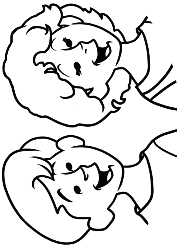
JOHN—JESUS IS THE SON OF GOD. ETERNAL LIFE COMES FROM HIM ALONE!

Print and cut out one set of 4 pictures for each student. Cut four pieces of construction paper: yellow, red, black, white. Students will color the pictures, then glue them to the construction paper as follows: 1. Matthew, yellow; 2. Mark, red; 3. Luke, black; 4. John, white. Put the pages together, punch holes, and use yarn to tie the pages together into a book.