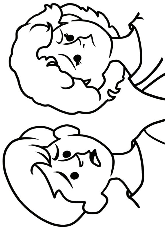
LUKE—JESUS CAME TO SEEK AND TO SAVE THE LOST.